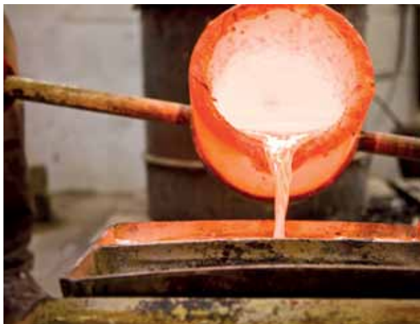
This page, from top: Sculpture studio, NUCA's foundry in the metal workshop.