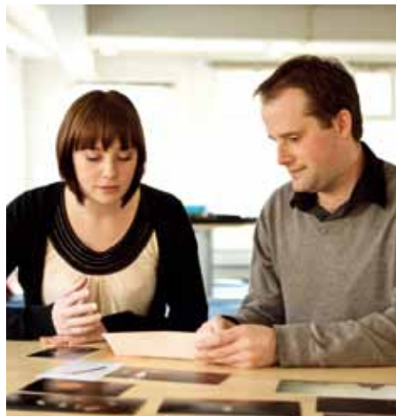
Opposite page clockwise from top: Work by Kellie Colby; Photography studio; One to one tutorial.